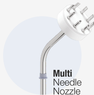
Multi Needle Nozzle